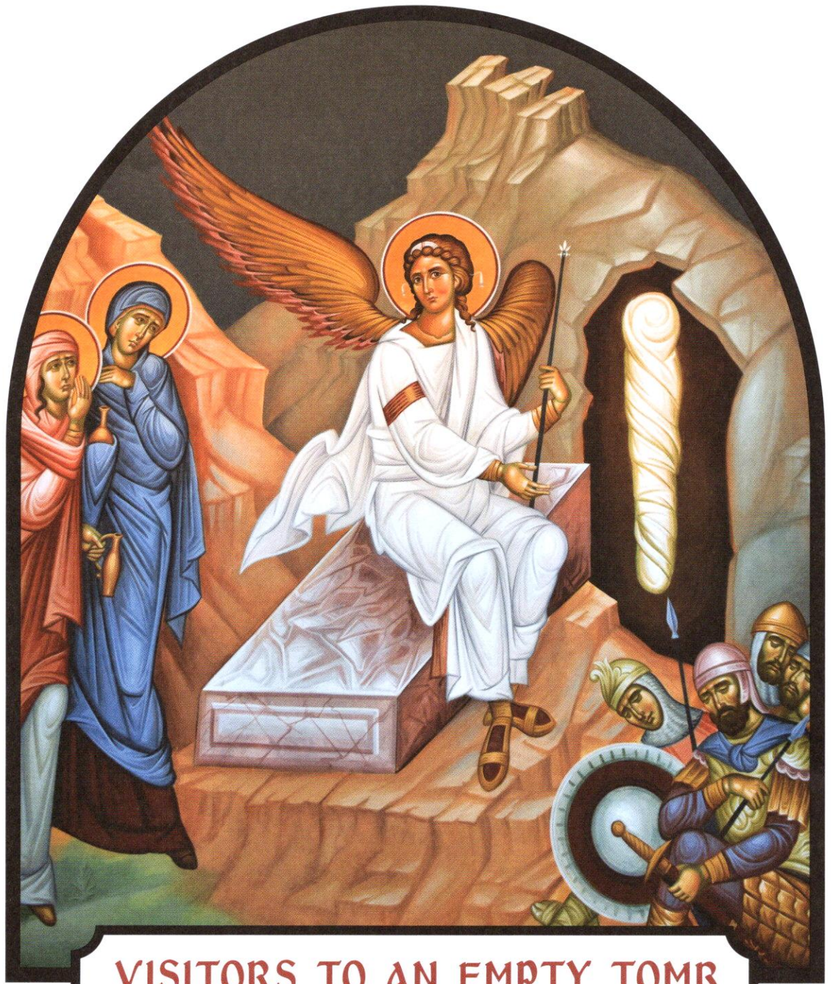
VISITORS TO AN EMPTY TOMB