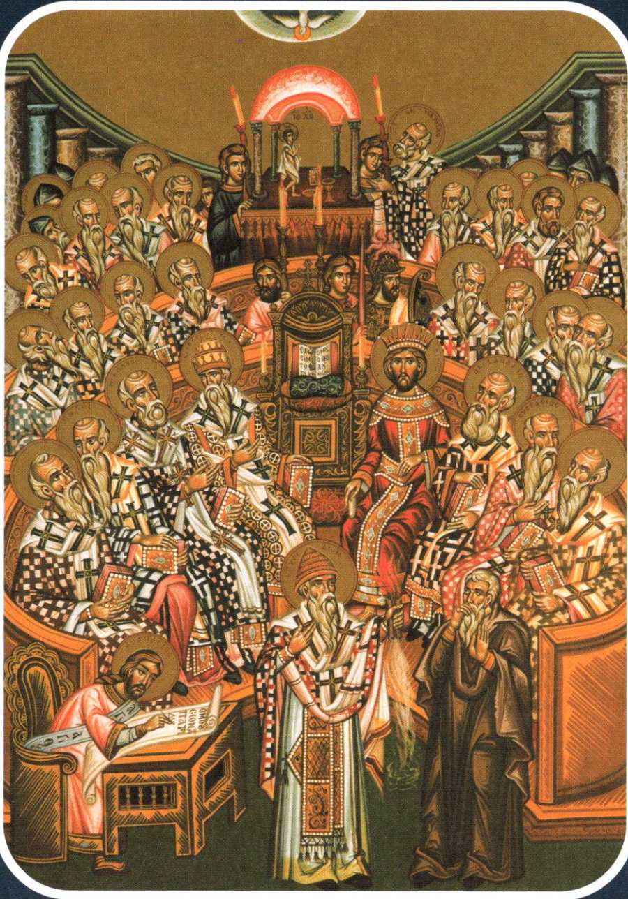
THE FIRST ECUMENICAL COUNCIL