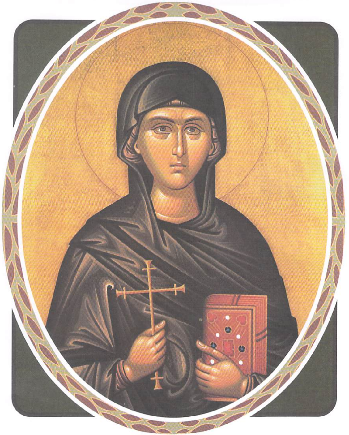
GREÆT MÆRTYR EUPHEMIA