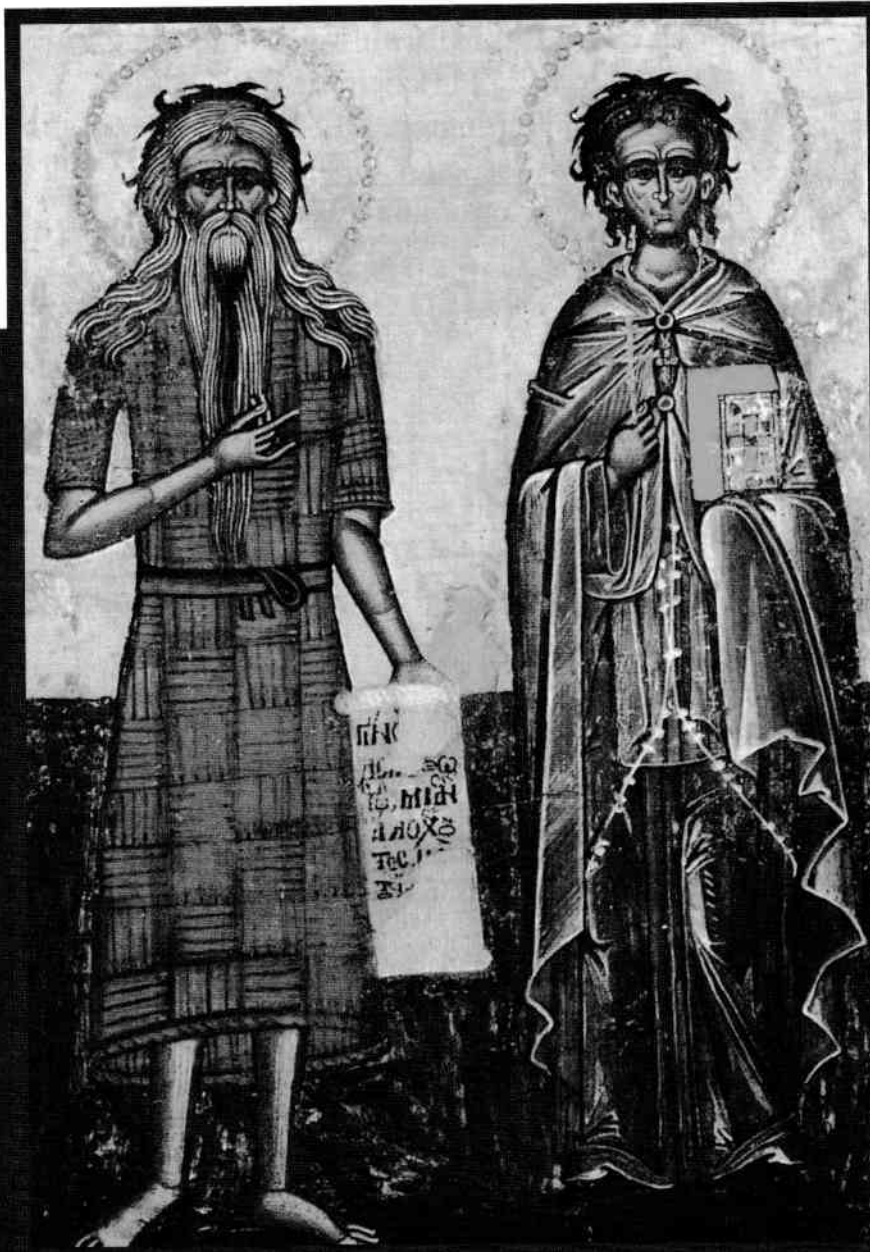
SAINT PAUL OF THEBES